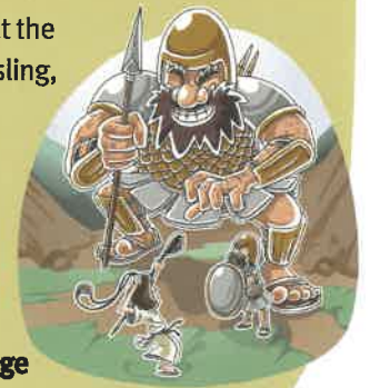
Bible story based on 1 Samuel 17

This was a day no-one would forget, when the courage of a shepherd boy saved a nation.